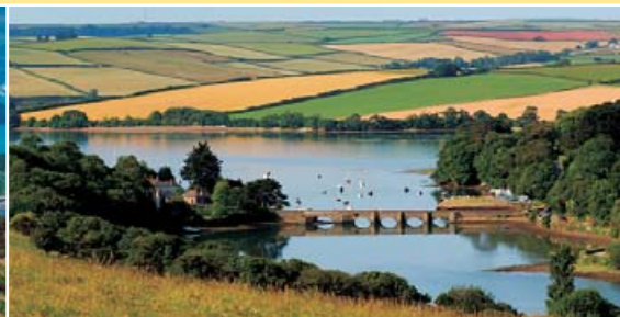
Bridge at Bowcombe Creek