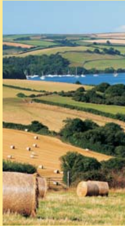
View over Kingsbridge

As you walk up Fore Street, it's worth looking above the shops to see that many of the buildings are slate hung as protection against the weather, but many are hiding medieval 15 th and 16 th century buildings. Explore the narrow side